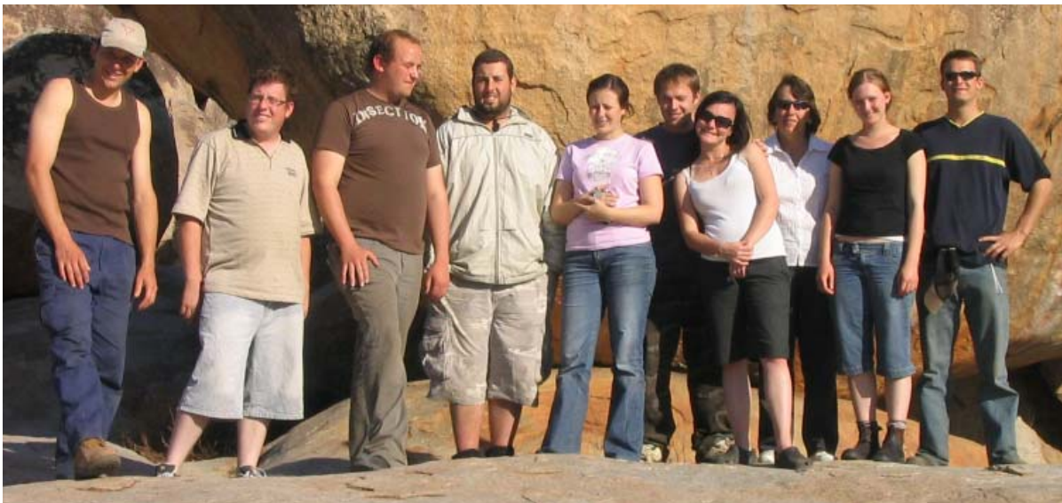
The Camden Uniting Crew