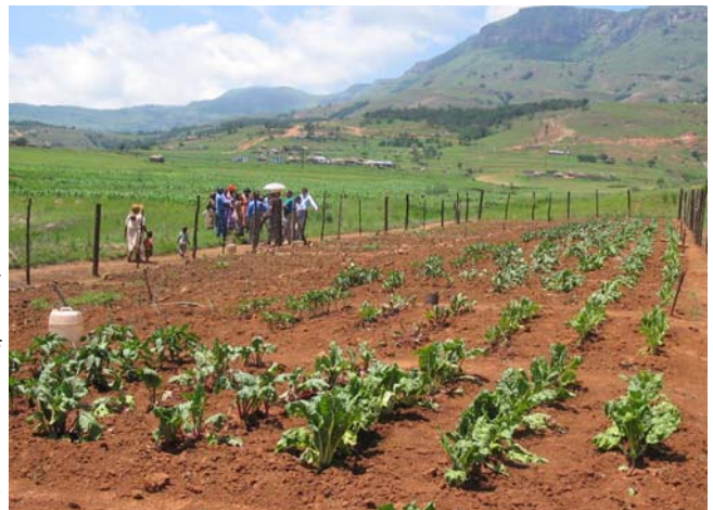
One of the community gardens sponsored by Philakahle

This is a fantastic work with least 222 orphans currently being directly assisted through the gardens project. There are plans to establish another 20 gardens this year, significantly expanding the impact of the project.