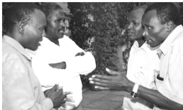
Participants in the AIDS Workshop hold animated discussion between sessions.

African AIDS Foundation is one of a number of supporters of the rural project which also distributes emergency food and medicine, implements garden projects, and provides chickens and fruit trees to help families support themselves. It is a vital aspect of the work of GGA, giving dignity, love and support to those in desperate need, through education, sports initiatives, self-sustaining food projects and more.