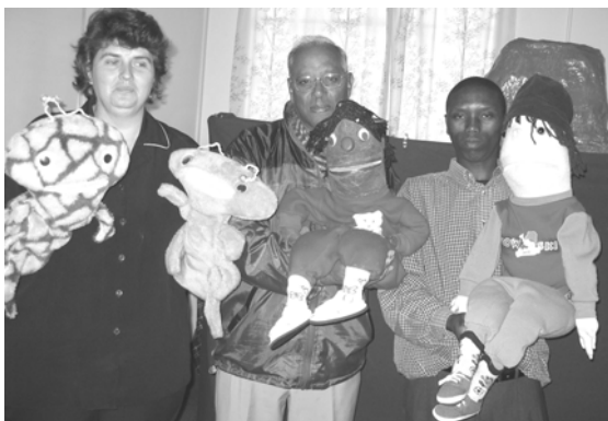
Some of the puppeteering team at Tabitha who each year present programs on AIDS to tens of thousands of school kids.

Following is a review of supported groups and some of their activities during 2004 – 2005.